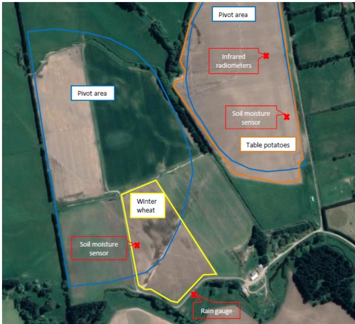
Figure 2: Farm map

Soil water management can make a huge difference to the profitability and sustainability of a farm.