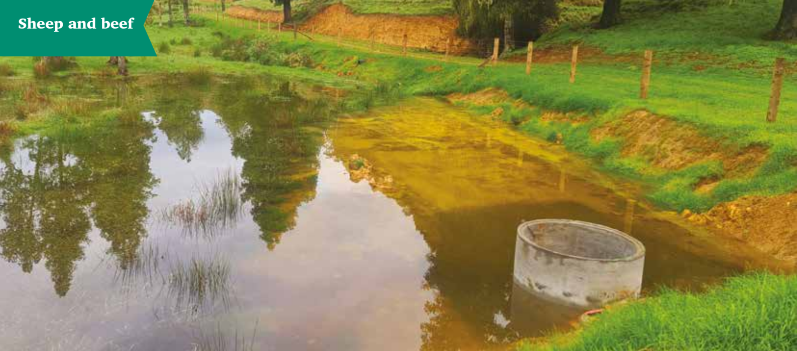
Sediment trap at Russell Proffit's farm

There's a whole lot of pressure to make improvements on-farm and we need more tools in the toolbox.