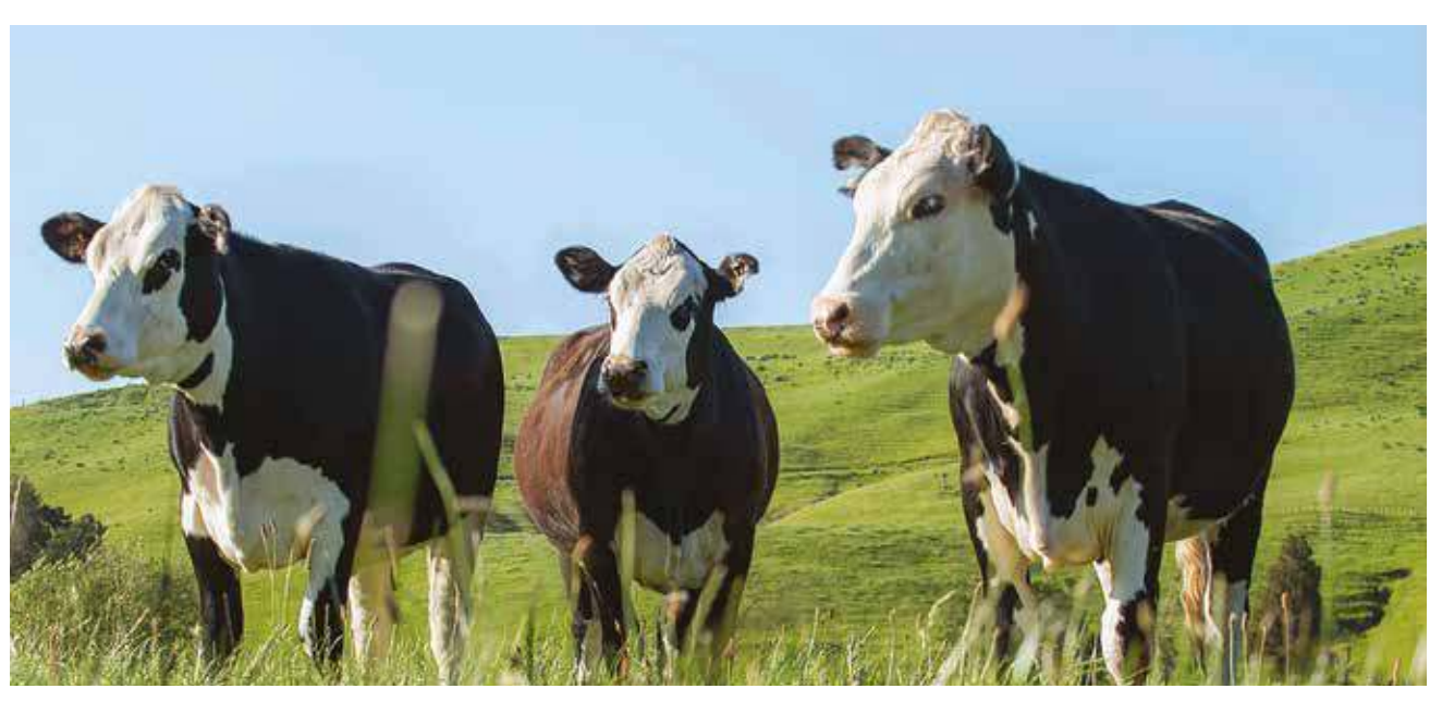
Dairy cross animals raised on regenerative farms have a different diet

NS: Not significantly different (P>0.05).