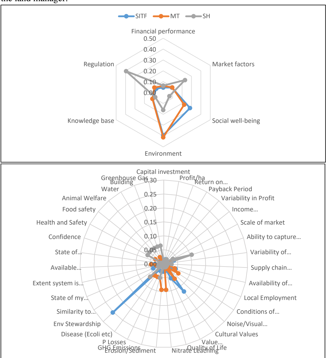
Figure 3.2 – The domain level weights (top graph) and corresponding sub-criteria weights (bottom graph) for each land manager. A higher value indicates a higher weighting is given by the land manager.

The development of tree nut crops is affected by a number of factors that operate across the value chain simultaneously and sequentially, with various feedback loops. This is shown in the CLD in Figure 3.3. There is a dynamic mix of social, economic, biophysical, and cultural forces that influence the progression from innovation into a NGS. In this case the environmental and socio-cultural values have a strong relationship to land use system change. We pose that for transformation, the scale of the nut crop estate (scalability) is a key factor which can be strengthened through cross-sector collaboration .