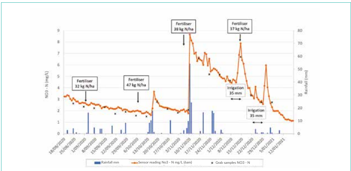
Figure 1: Changes in sump nitrate-nitrogen concentration over the cropping period. Both sensor and grab sample nitrate-nitrogen concentrations are shown along with rainfall, irrigation and fertiliser applications

the southern hemisphere and is currently moving their cropping operations to organic production. This will see 1,500 ha of organic cropping added to 680 ha of organic apple orchards, with most of these crops exported.