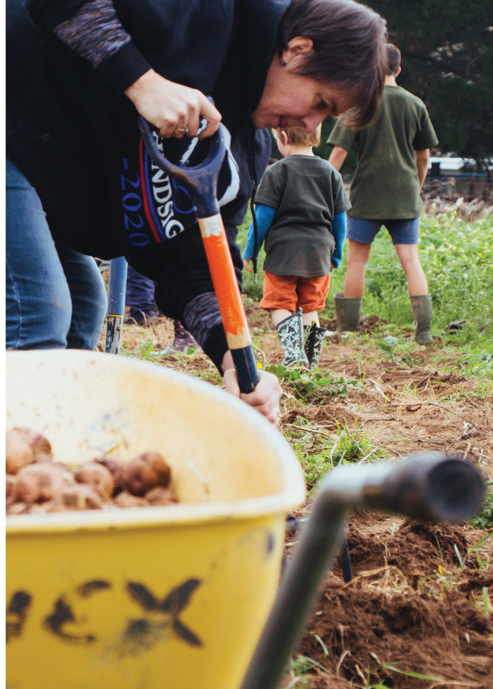
Flourishing māra. Koukourārata 2017.