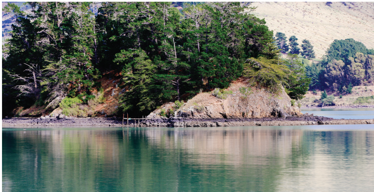
Top left: Taewa, traditional Māori potato varieties; harvest day; Te Pātaka o Rākaihautū