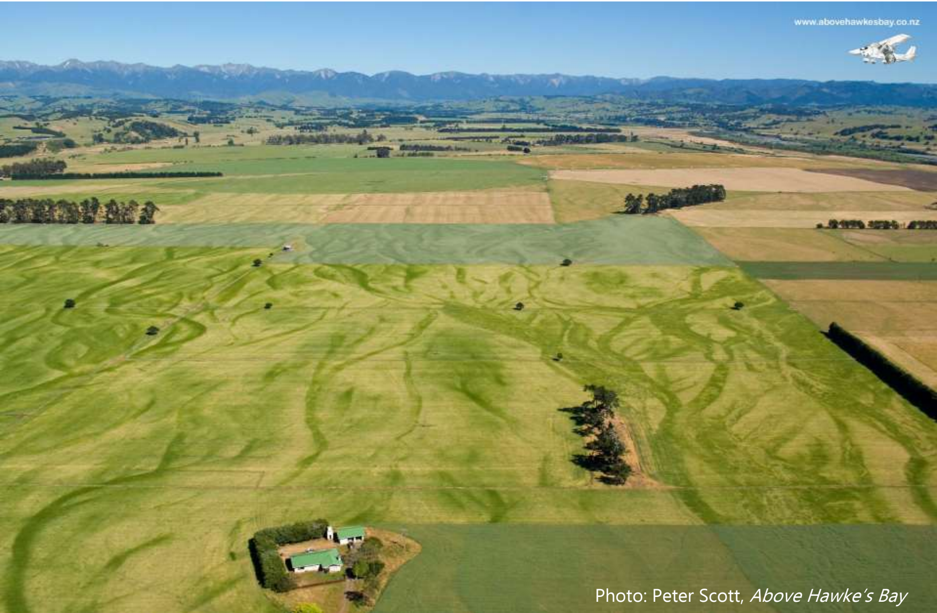
Above Hawke's Bay