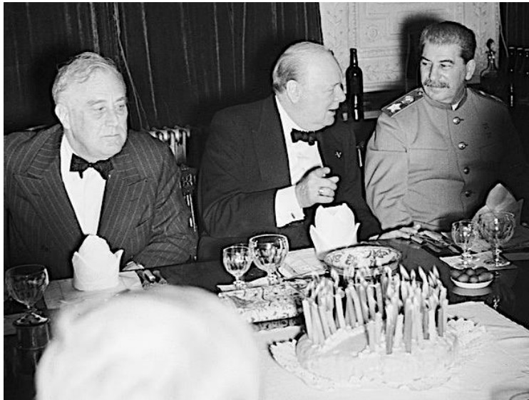
Winston Churchill Fifty Years Hence , 1931

Nor need the pleasures of the table be banished. The new foods will be practically indistinguishable from the natural products from the outset, and any changes will be so gradual as to escape observation.”